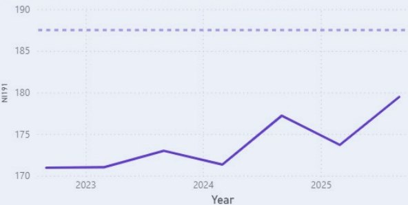
Kg of General Waste per household (NI191)