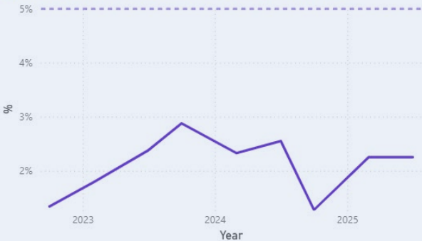
Local Environmental Quality - Overall % (NI195)